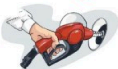
G as tank

danger – bumper - windshield wiper – gas tank – trunk